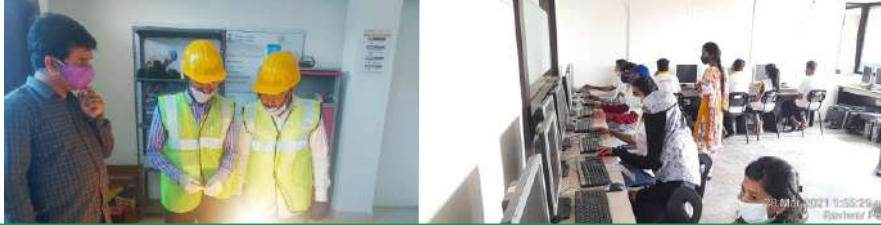
Trainings for the Candidates under IT & Electronics Sector

We are developing and strengthening the skills, instincts, abilities, processes and resources that organizations and communities need to survive, adapt, and thrive in a fast-changing world. Our Capacity Building program is designed to develop effective and well-managed organizations that make best use of their human and financial resources to maintain business sustainability.