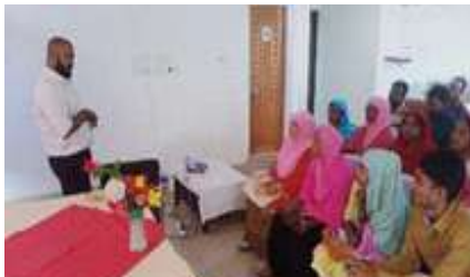
Capacity Building Training Programs for FPO's Farmers

NSEPF is working towards skill training of individuals, corporates, developmental institutions, cooperative leaders. NSEPF is trying to Improve the global competitiveness of India in various sector by investing in capacity building initiatives and skill development through introduction, showcase and dissemination of global and Indian best practices on skilling of youth on current and emerging trends in every sector.