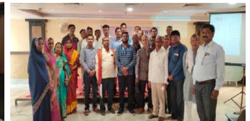
Capacity Building Training Programs under Food Processing

NSEPF aims to empower local communities, enhance skills, and improve livelihood opportunities. These programs can cover various areas, such as: